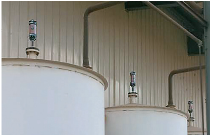
Bulk storage tanks refitted with desiccant breathers.